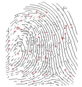
Figure 9: Minutiae Information Extraction

International Journal Of EngineeringResearch & Management TechnologyISSN: 2348-4039Email: editor@ijermt.orgMay- 2017 Volume 4, Issue 3www.ijermt.org