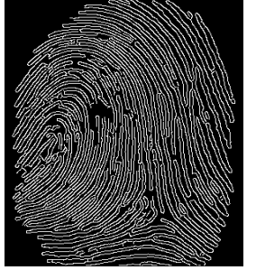
Figure 4: Fingerprint Considered from Dataset

Figure 4 shows the initial input image considered for the experimentation of latent fingerprint reconstruction and recognition. This image is taken from the FVC 2002 database. Further, segmentation function is performed to separate the front fingerprint information from the background noise value. This image is shown in figure 5 after the removal of background noise from the image.