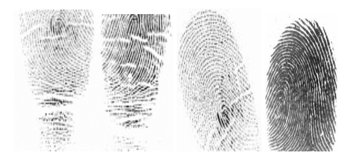
Figure 1: Dataset Images of FVC 2002

For experimentation FVC 2002 fingerprint dataset is used. It consists of latent to rolled fingerprints [4]. These images are of approximate 500 PPI. These image are taken using capacitive and sensor dataset. Some sample images are shown in figure 1.